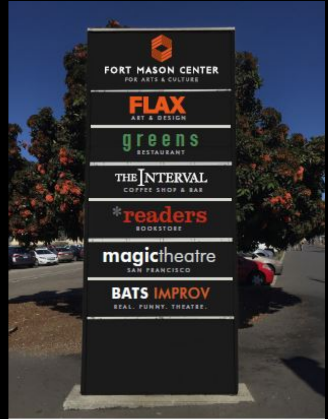
Buchanan Gate Sign