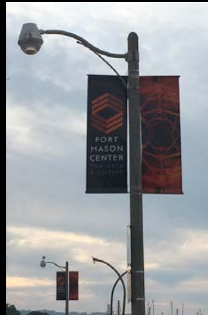
Street Pole Banner