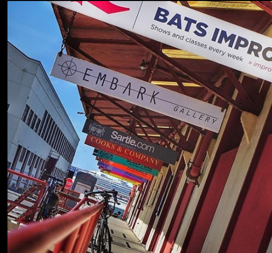
Building B, C and D blade signs

Building B, C and D residents can fabricate and install an external blade sign measuring 84" wide x 14" high: Signs can be designed by residents and submitted to FMCAC for approval. Content should be limited to name, logo and tagline. Ground floor residents open to the public on a daily basis may be eligible to install more than one sign.