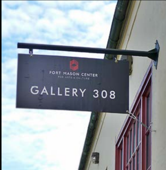
Building A blade sign

Building A residents can fabricate and install an external blade sign measuring 4' wide x 2' high. Signs can be designed by residents and submitted to FMCAC for approval. Content should be limited to name, logo and tagline.