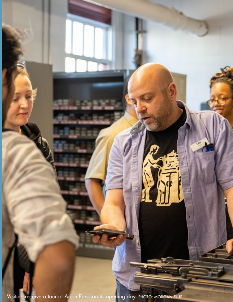
Visitors receive a tour of Arion Press on its opening day.

Arion Press offers tours, artist and author talks, and other special events throughout the year. The gallery and retail store are open Tuesday through Saturday, 12pm to 5pm. For more information, visit arionpress.com .