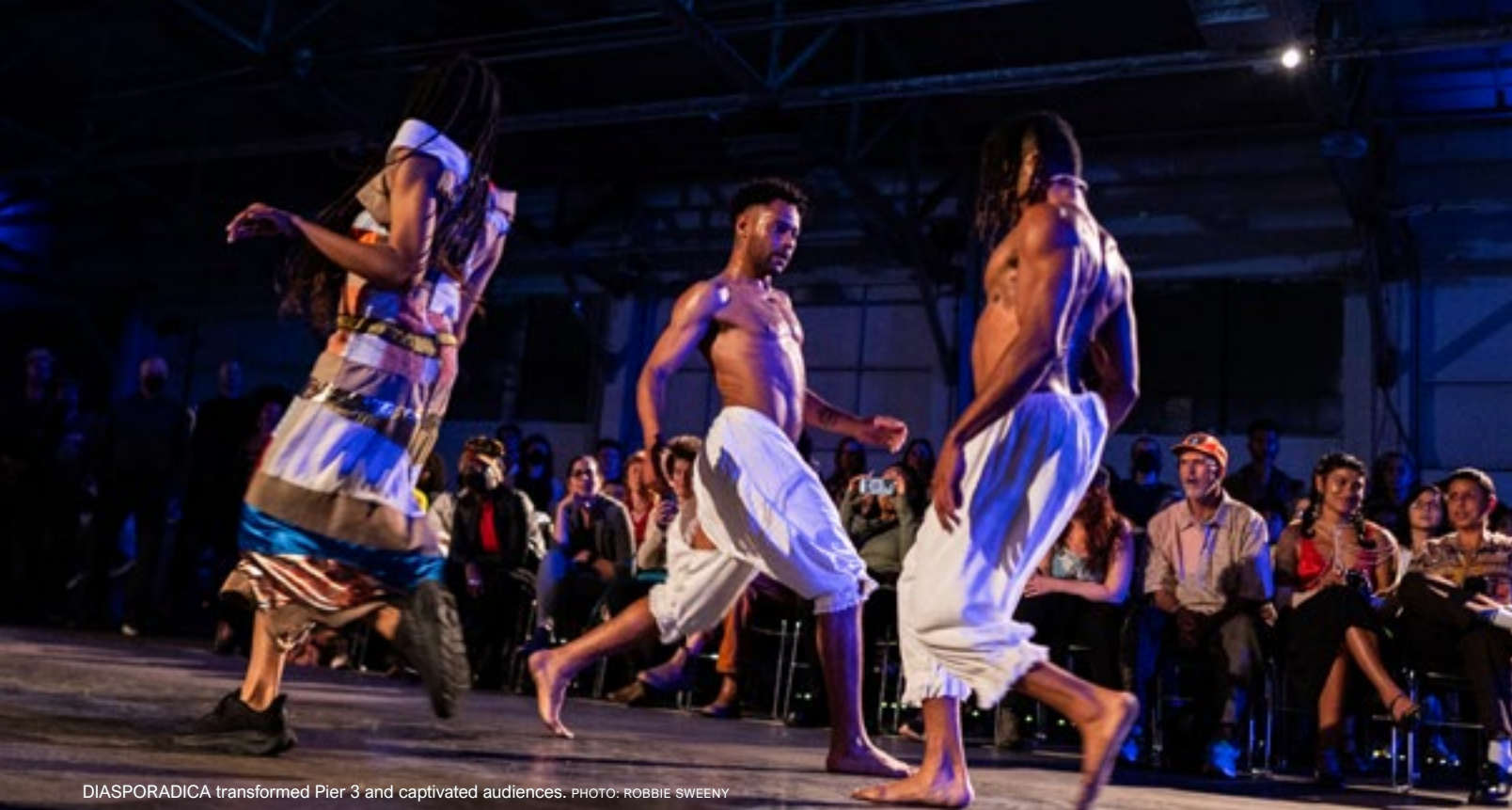
DIASPORADICA transformed Pier 3 and captivated audiences.