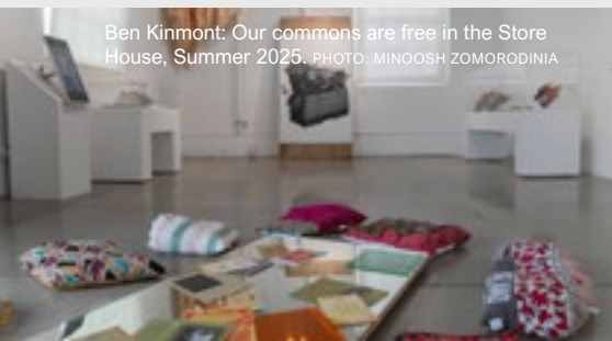
Ben Kinmont: Our commons are free in the Store House, Summer 2025.