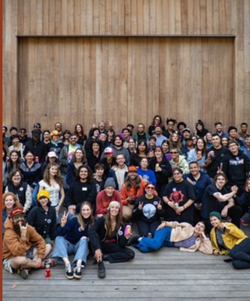
Stern Grove Festival staff in full force, made up of a dedicated seasonal team and an amazing fleet of volunteers.

Fort Mason Center for Arts & Culture has already partnered with Stern Grove Festival to present live music at Fort Mason Night Markets, with additional programming planned for the 2026 Night Market season beginning in April.